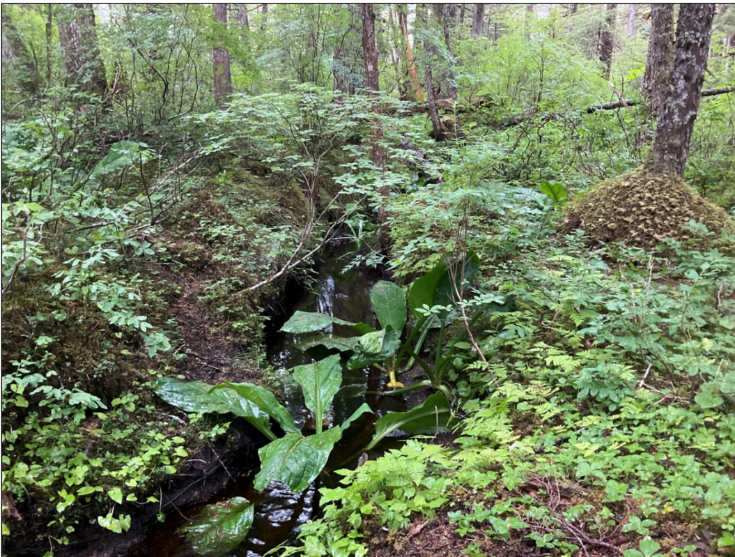
Figure 2.—Tributary 3 at waypoint 1216.