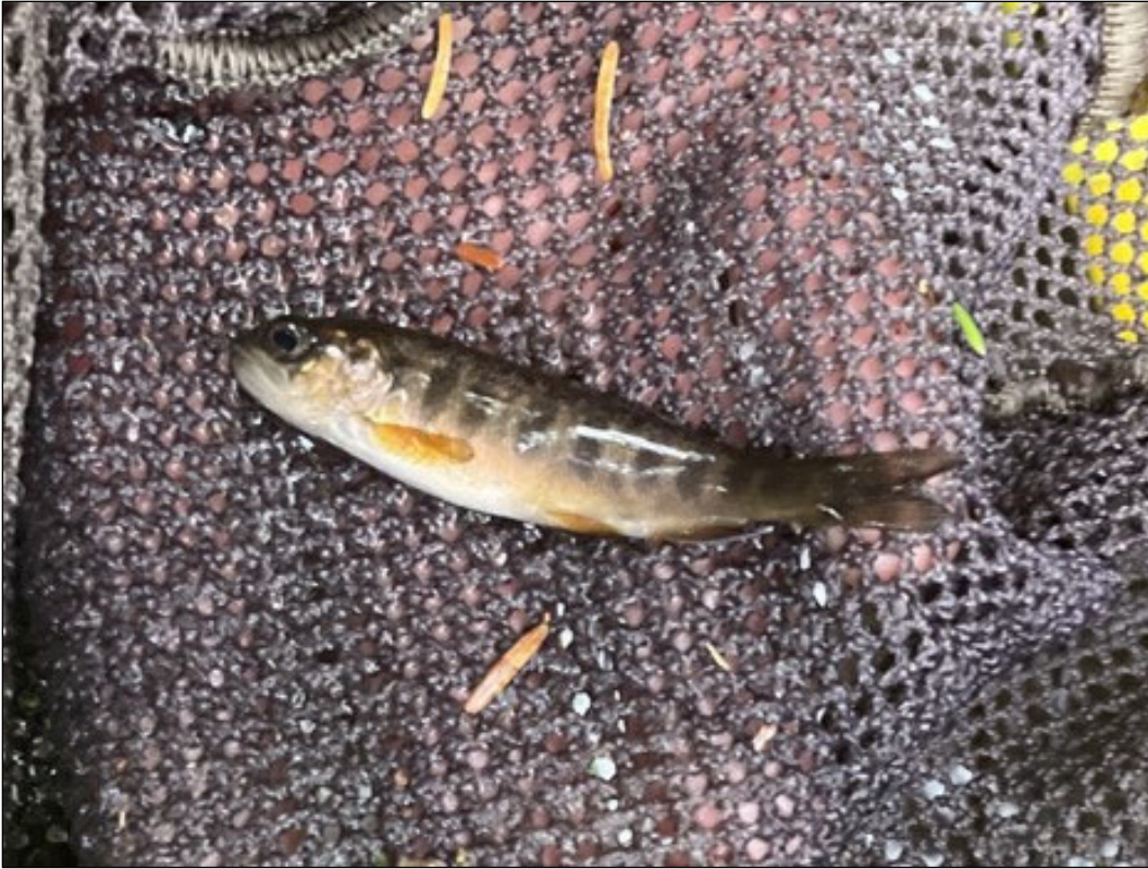
Figure 1.—Juvenile coho salmon captured at waypoint 1216.